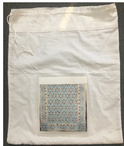
Sample of cloth bag with plastic pocket

Bag Pockets: Each bag requires a plastic pocket sewn on the outside. Use the page protectors from your office supply store. Stitch close to the outside perimeter of the plastic, onto the center front of your muslin bag. This pocket should have a photo of the quilt the bag contains. Your name and phone number should be printed below the pocket in marker.