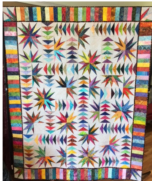
Rhapsody of Stars – WQG Raffle Quilt 2018